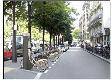
Public bicycle systems

COLLABORATIVE PROBLEM SOLVING ON THE COMMONS The New Mobility Agenda - www.newmobility.org Europe : 8-10 rue, Joseph Bara 75006 Paris, France USA: 9440 Readcrest Drive, Los Angeles, CA 90210 partnerships@newmobility.org Skype: newmobility