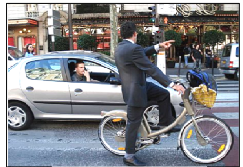
Showing the way

All of the public interest work, content, reports and websites of our programs have from the beginning been made freely available to all comers as a point of principle. We figure that if our goal is to make a contribution we should be trying to share our materials and findings as broadly as possible – and the web permits us to do this efficiently. Moreover many of our colleagues, especially of course students and many of those working in the developing counties, are in a position where they simply cannot afford to pay for this support. But you perhaps can chip in and help.