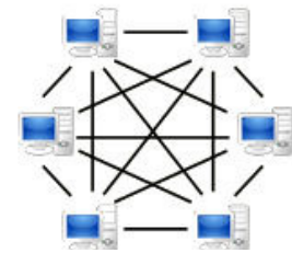
World-wide peer-to-peer networks

We find that broad blank swath that runs right up through Africa and on north-west extremely worrying. Don't you? It is the same disturbing pattern that we observe in all our projects. So now what do we do?