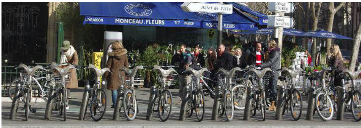
Plenty of scope in our cities for good new ideas

Proposal for in-pocket communications and access system serving users who want to have access to the best way of making their trip. The core of the concept is to harness mobile phones as the real-time interface between travelers and all available mobility means. We can bring our strategic competence into a project, but the expertise and resources have to come from elsewhere. * www.clík2.newmobility.org