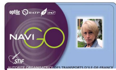
Universal mobility pass