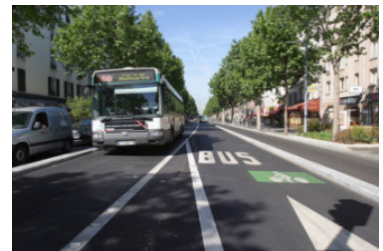
High occupancy vehicle priority